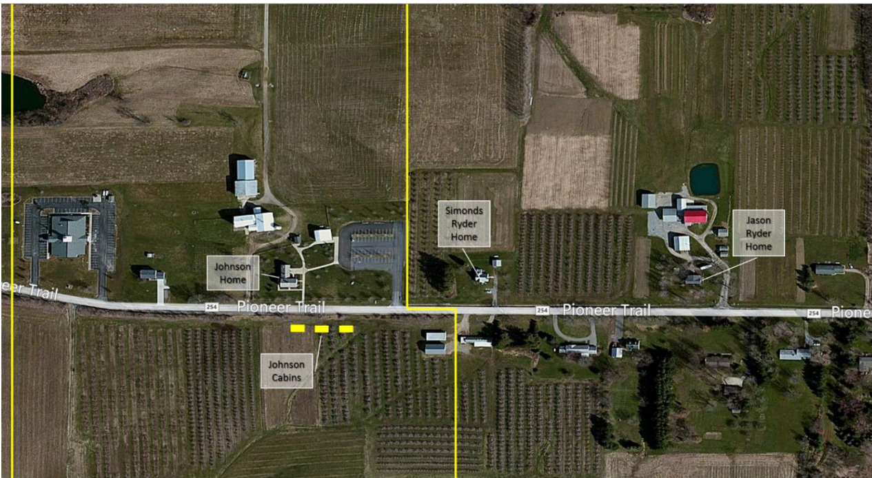
Image #4: Johnson farm, cabins, and Ryder properties, Hiram, Ohio. Johnson property boundaries in yellow. Note the LDS church on the west edge, and the cabins (not there now but marked in yellow rectangles) where Sidney Rigdon lived.