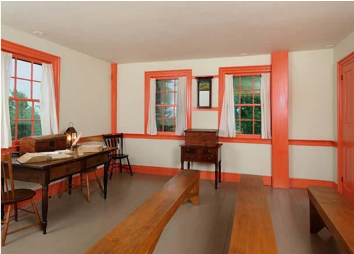
Image #3: "Translation room" in the Johnson home, Hiram, Ohio, built by splitting the Johnson bedroom with a new wall, where Joseph Smith worked on the Bible translation and held several Church conferences in 1831-1832.